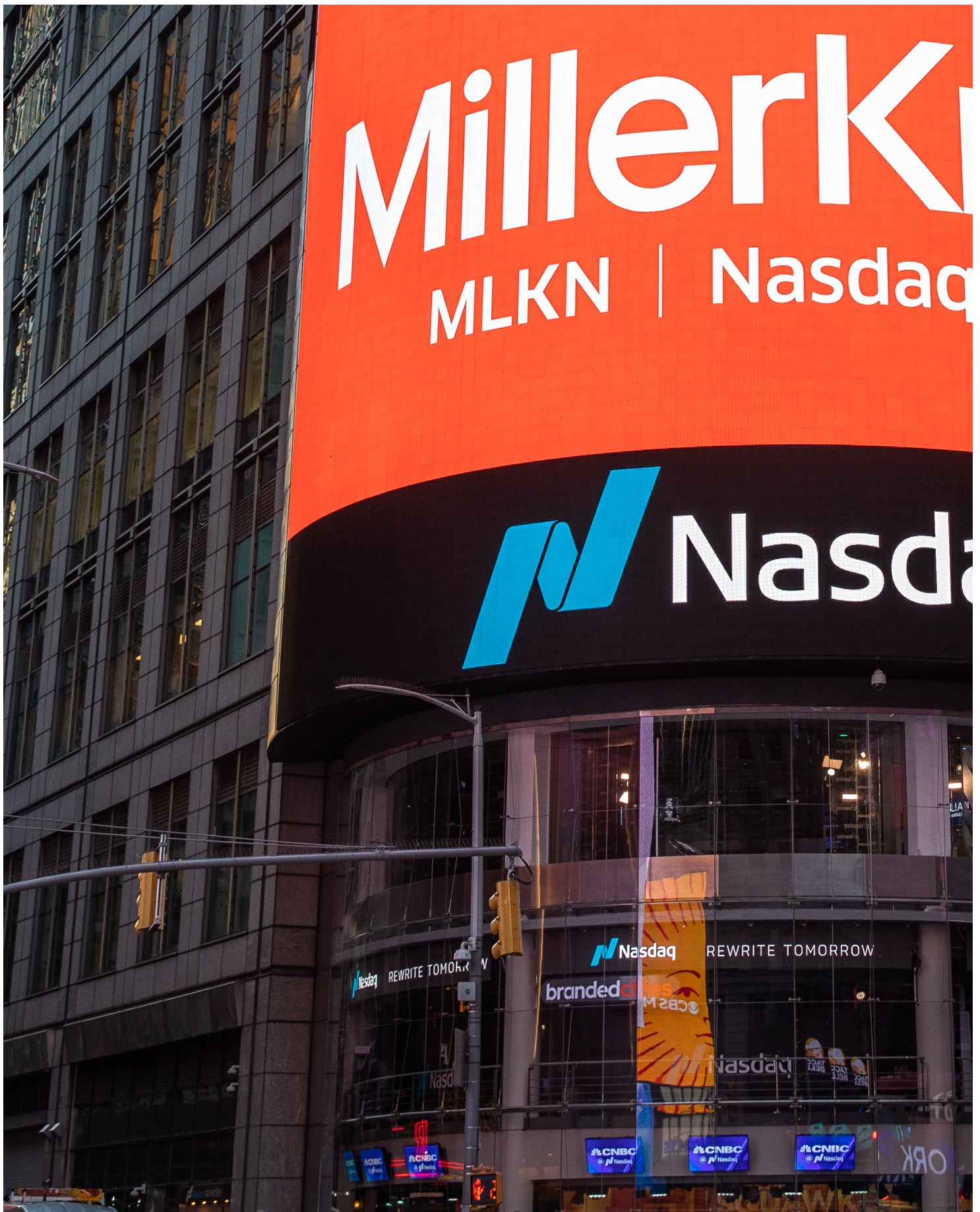
MillerKnoll on the NASDAQ Tower

ZEELAND, Mich., Oct. 29, 2021 /PRNewswire/ -- Herman Miller, Inc., (NASDAQ: MLHR) will change its ticker symbol on the NASDAQ Stock Exchange from "MLHR" to "MLKN" at the open of market trading on Monday, November 1, 2021.