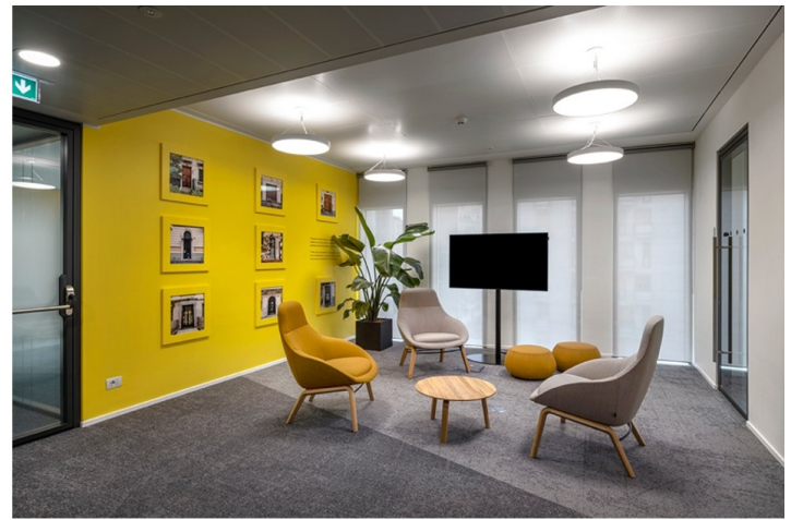
Left: Products from across MillerKnoll's Collective of brands share the floorplate; Right: NaughtOne's Always Lounge Chair and HAY's Bella Coffee Table create inviting spaces, with colors tailored to the theme of the floor