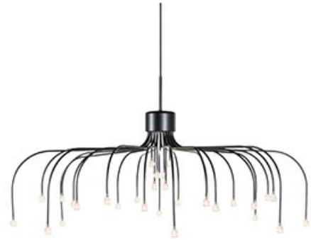
Left to Right: Nomnom Pendants and Starfall Pendant

Now offered in a dazzling new Grey Galaxy Marble (a DWR exclusive) the Plinth Table Collection showcases the natural beauty of marble in minimalist, monolithic forms. Offered in a range of sizes and marbles, Plinth is a sleek take on the centuries-old idea of a podium.