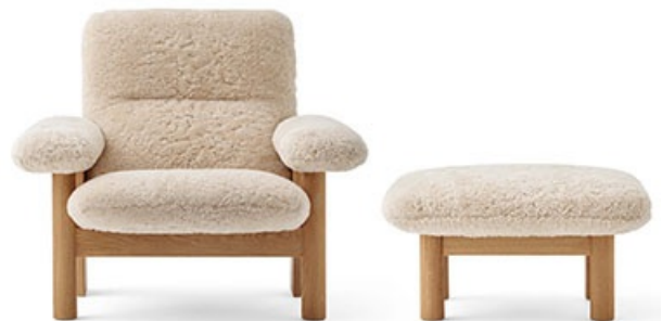
Left to Right: Falcon Chair, Brasilia Chair