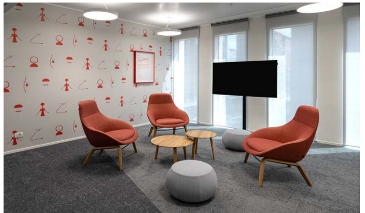
NaughtOne's Always Lounge Chair and HAY's Bella Coffee Table create inviting spaces, with colours tailored to the theme of each floor.