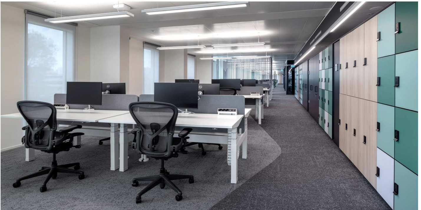
The Aeron Chair with ocean-bound plastic supports Oracle Italia's environmental aims.

Ergonomic support and movement are both themes which continue in other parts of the Oracle office. Sayl Stools are used to create places for short burst of focused group work, while Keyn Chairs, which offer responsive movement as the user shifts in their seat, have been used in meetings rooms throughout the building.