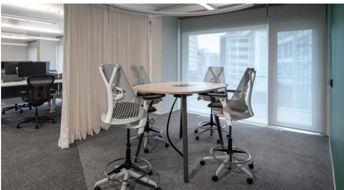
Sayl Stools give ergonomic support for focused group work.