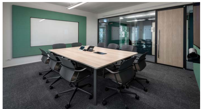
Every meeting room offers responsive movement for users thanks to the Keyn Chair Group.